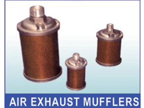
AIR EXHAUST MUFFLERS

We Also Offer All Makes All Models Roatry, Piston & Screw Compressors