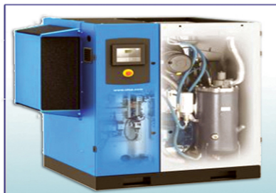
AIR COMPRESSOR MAINTENANCE