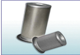
AIR OIL SEPERATOR