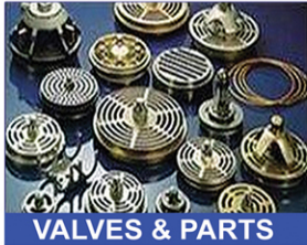
VALVES & PARTS