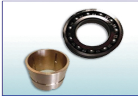
BUSHING / BEARING