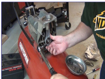
AIR COMPRESSOR REPAIR SERVICE

We Also Offer All Makes All Models Roatry, Piston & Screw Compressors